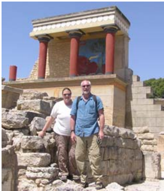
Knossos ruins in Crete