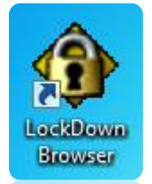
Desktop Icon for LockDown Browser