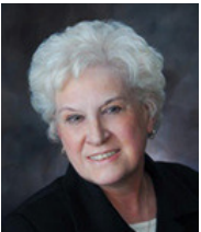
Diana Osborn Chair